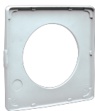
S 100/4 Code 22154