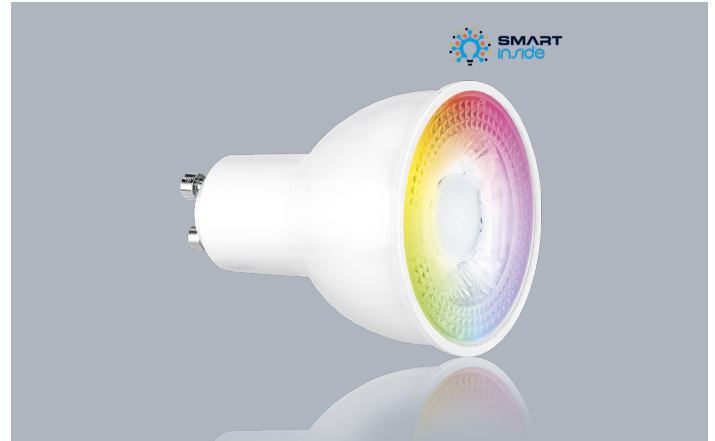
AOne™ Smart Dimmable RGB and Tuneable White GU10 Lamp